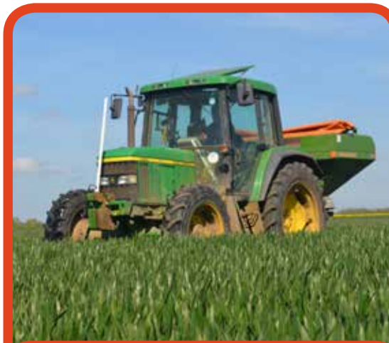
Nourishing milling wheat