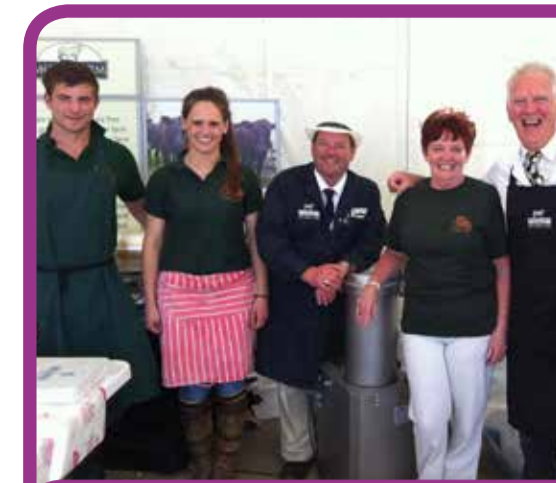
Staff from the Moor Farm Shop