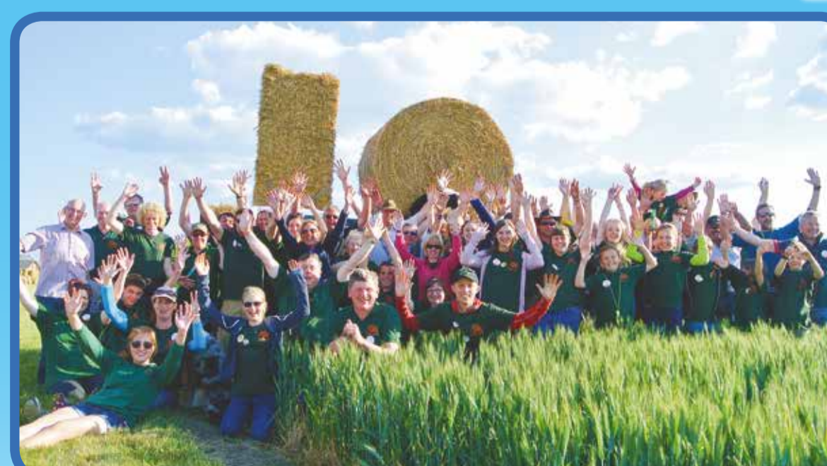
10th Anniversary 2015